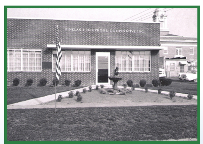
The Cooperative's headquarters, relocated to Metter, Georgia in 1954.